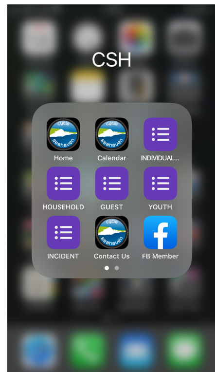
Fig 2 : Direct Club links within a folder saved onto iPhone home-screen